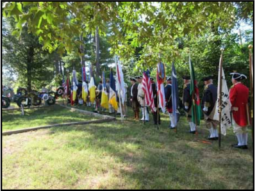
Color Guard members standing guard over the enclosed mass grave of the casualties of the Battle of Ramsour's Mill.

Casualties were difficult to assign since almost no one was wearing any sort of uniform. Estimates of dead on each side were between 50 to 70, with about 100 wounded on each side. The battle, in which muskets were sometimes used as clubs because of little ammunition, was fought between "neighbors, near relations, and friends". Casualties were buried in a mass grave near Ramsour's Mill after the battle ended.