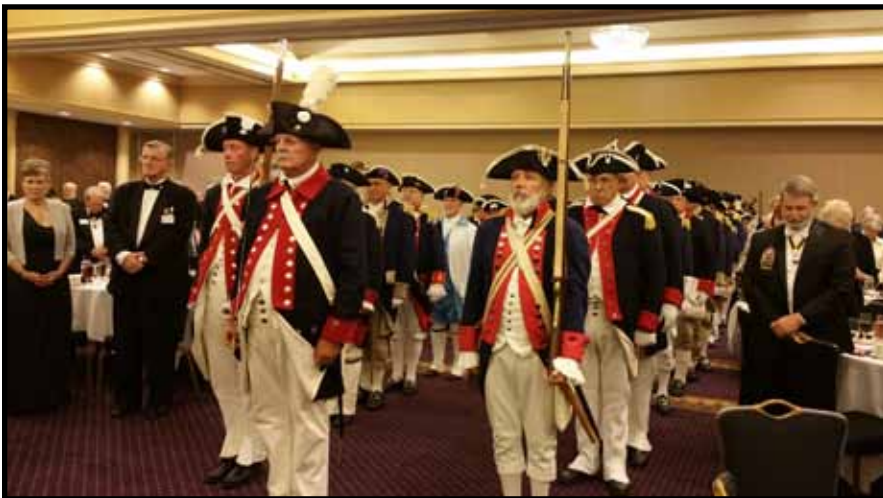
Color Guard at Wednesday Banquet