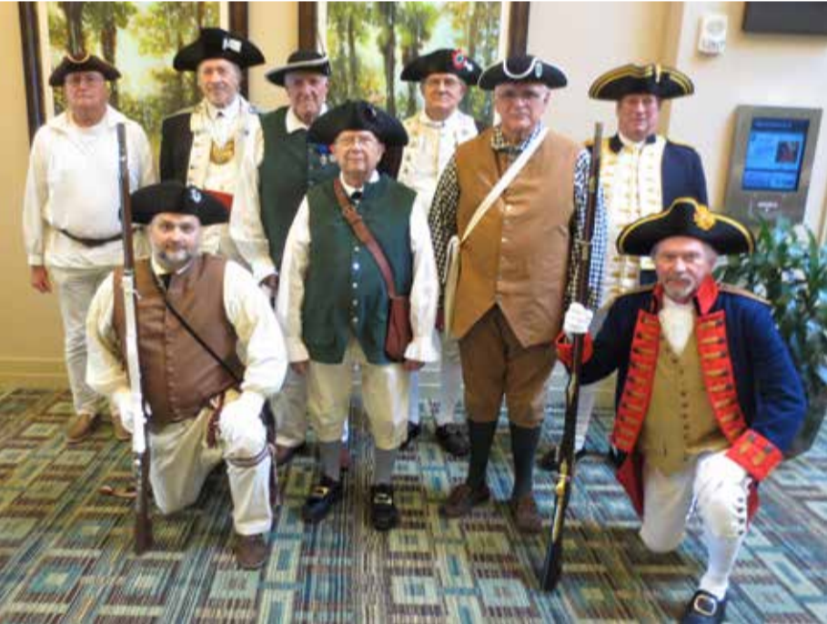
Florida Colour Guard at Winter Board of Management Meeting in Orlando