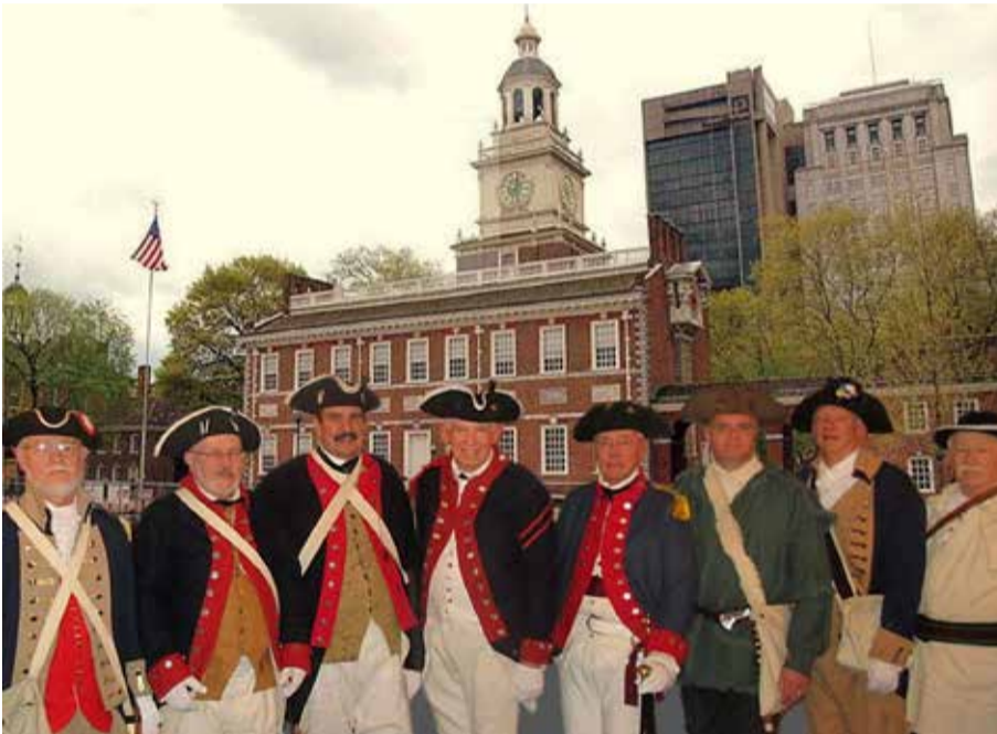
Spring Leadership conference presentation of colors, "right flank" column