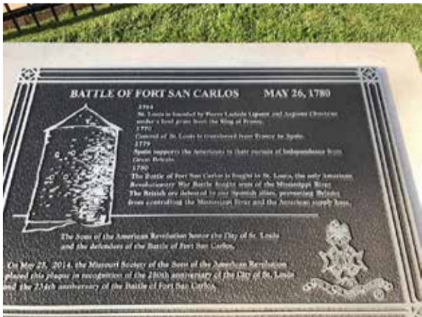
Fort San Carlos