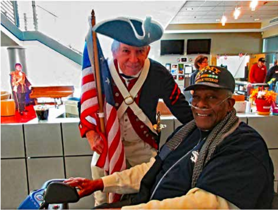
Disabled Army Vietnam Veteran and honored guest ask Gary for a photo