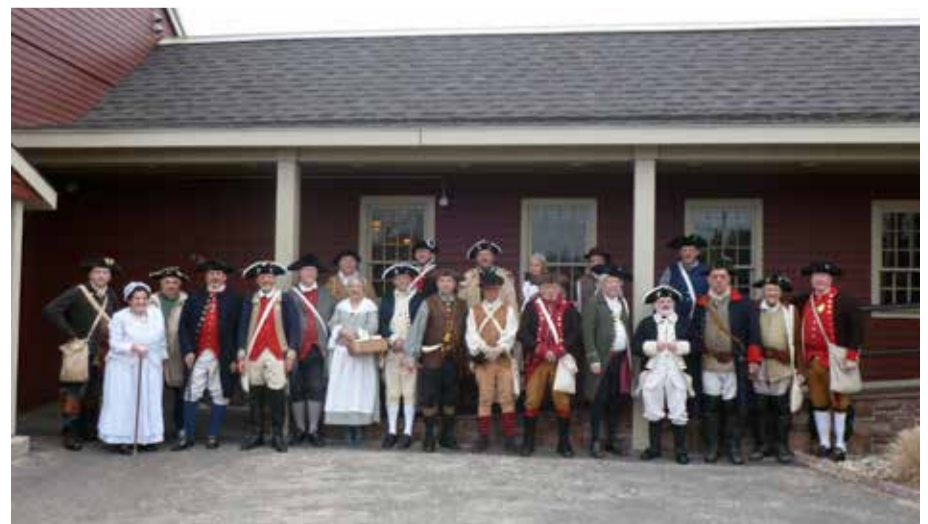
Group photo outside of the J. Timothy Taverne following the meeting.