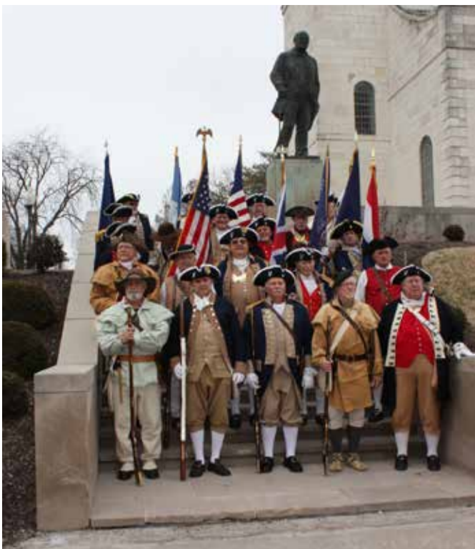
As is customary, the Color Guard presented the colors at the Memorial Ceremony and the Luncheon at the Annual Conference of the Kansas Society. Color Guardsmen also participated in the Memorial Ceremony recognizing the Compatriots who had passed in the last year the Memorial Ceremony included a Flag Folding.