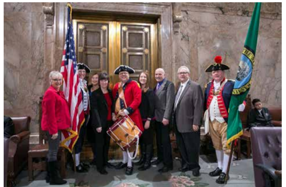
A group photo with members of the Washington State House of Representatives.

House of Representatives, by Alexander Hamilton Chapter, Color Guard. At the conclusion of the Colors, the House adjourned so members could have their photographs taken with us. We were surprised to see how many Representatives included our photo in their newsletters across Washington State. What a powerful way to passively spread the word of the SAR.