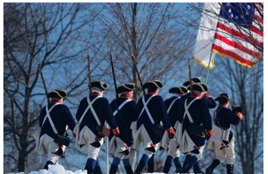
Photo by John McCosh. More pictures of this event can be viewed/purchased at http://www.johnmccoshphotography.com/