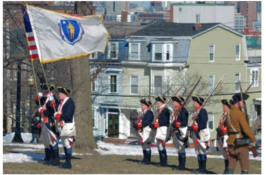
More pictures of this event can be viewed/purchased at http://www.johnmccoshphotography.com