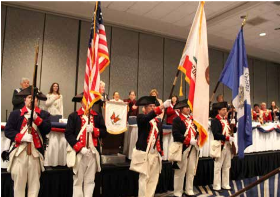
Photos from the 110th Annual State Conference of the California Society Daughters of the American Revolution