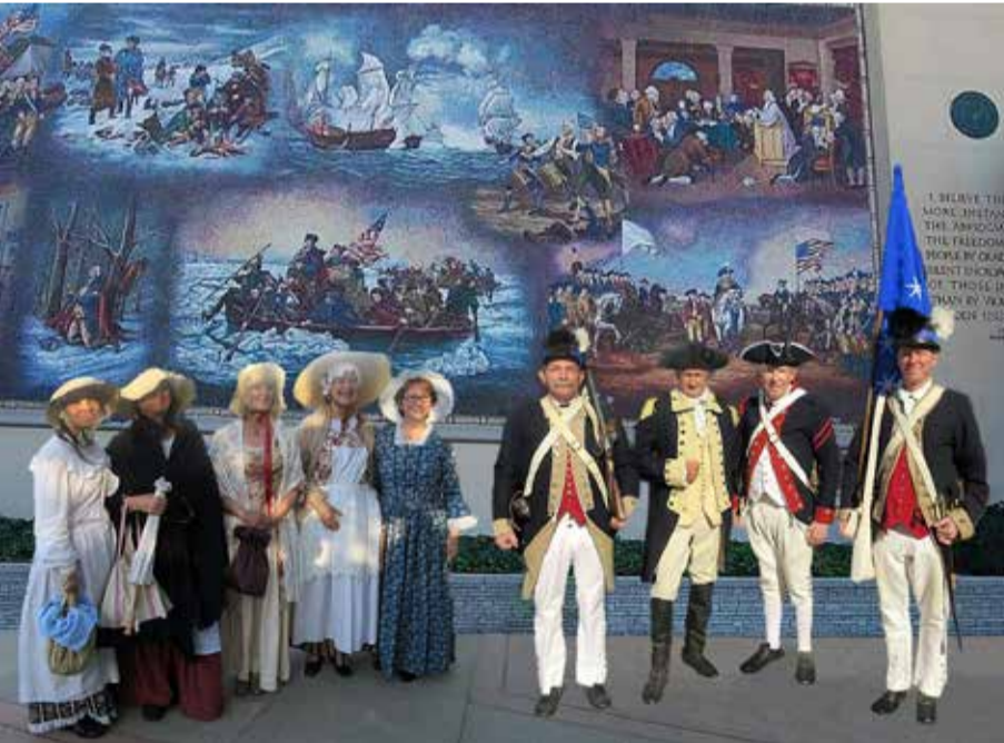
Massing of the Colors Group of participants representing Colonial Ladies and General Washington and his Guards

Quilts of Valor, Honor Flight Southern Nevada and Public Broadcast TV Station, Vegas PBS and these organizations' supporters and their volunteers were some of the most visible supporters of this event. Thank you all for your ongoing support of our veterans