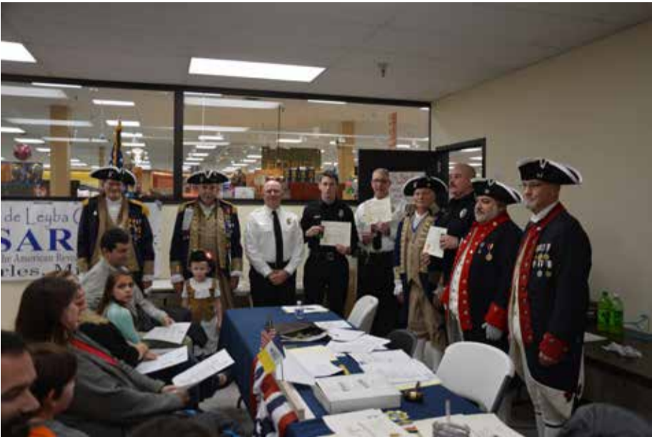
Law Enforcement Commendation Award Medal and Certificate