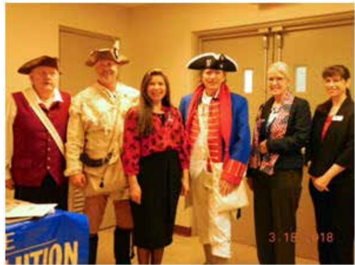
SAR & DAR with New Citizen after Naturalization Ceremony