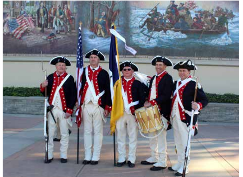
Left and Above: Massing of the Colors and Salute to Our Military, Forest Lawn Cemetery, Hollywood Hills, CA; February 18, 2018