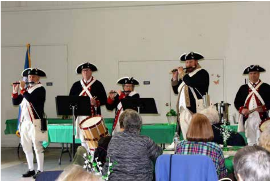
Fifes & Drums of Nevada performed for the DAR Nevada Sagebrush Chapter’s monthly meeting.