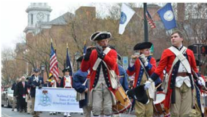
The Frederick Fife and Drum lead the Virginia SAR past the reviewing stand