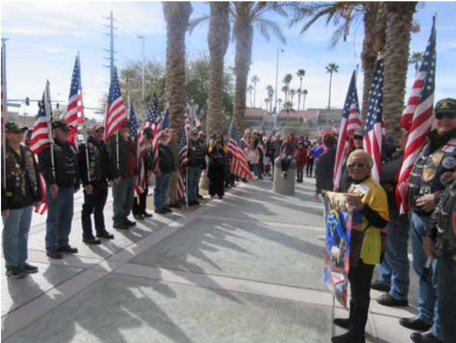
Flag line of greeters (with Patriot Guard Riders to the left) await the exiting Veterans