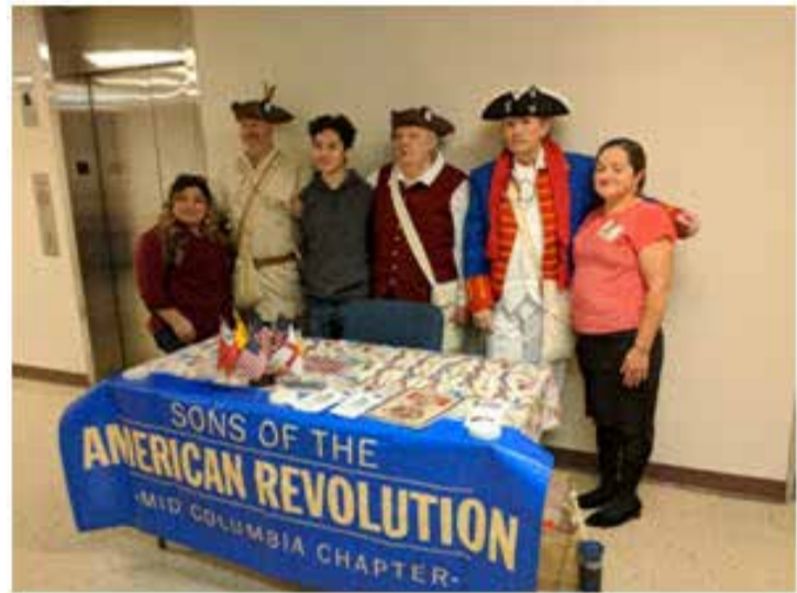
SAR with New Citizens