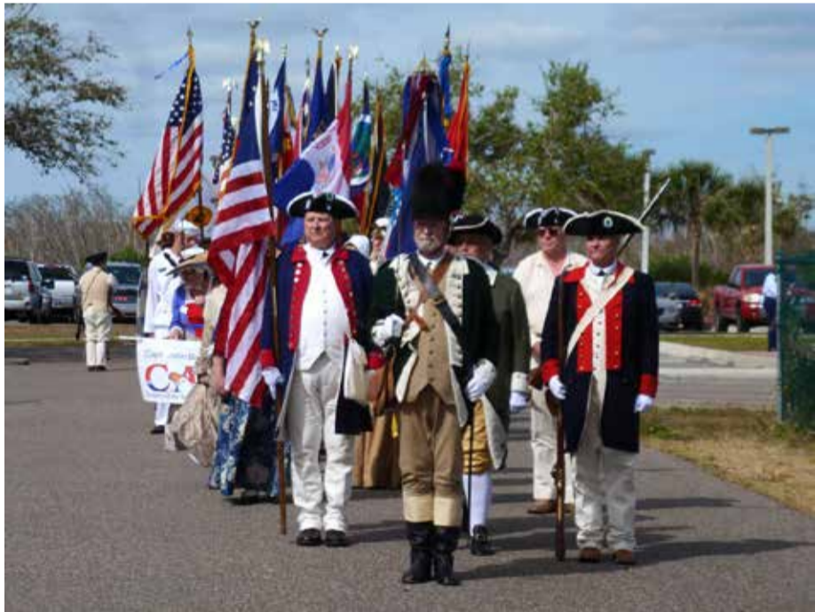
(Above) The parading of the assembled colour guard at the ceremony for the Last Naval Battle of the American Revolution held this March 10th at the Merritt Island Veterans Museum.