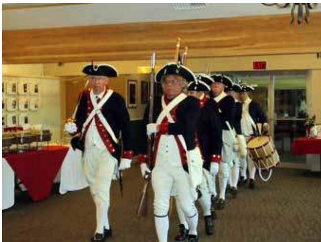
Presentation of Colors by the combined Nevada Society SAR Color Guard

On Sept. 16, the Signers Chapter hosted its annual Constitution Day Dinner at the Las Vegas National Golf Club with the Silver State Chapter, NVSDAR for the second year.