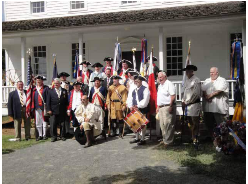
Photo of NC Color Guard at the House in the Horseshoe.