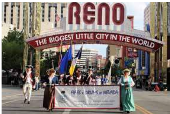
Marching up Virginia Street beneath the iconic Reno Arch