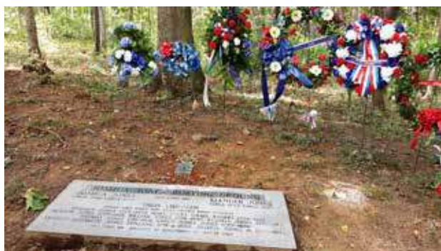
Cenotaph placed at the Jones Family graveyard