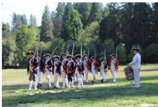
Revolutionary War Days Encampment – Parade Drill