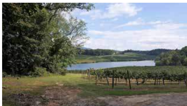
Panorama view from the grave site