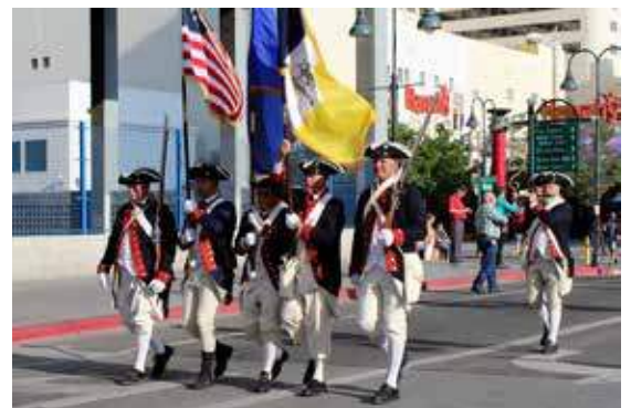
Betsy Ross Flag, Nevada State Flag and SAR Flag flanked by muskets.

Our entry for the Parade was positioned just before the American Legion's hosting Department of Nevada. A Combined group of Nevada Society Color Guardsmen, Ladies