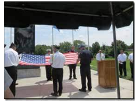
Members of American Legion Post 189