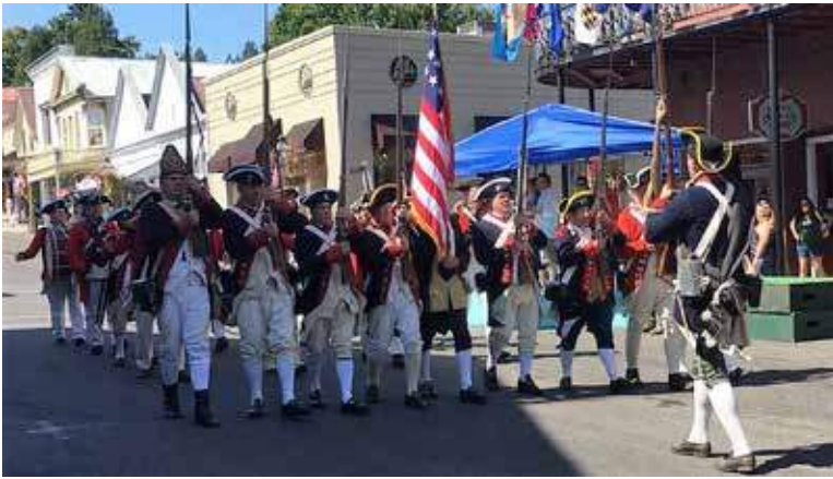
Constitution Day Parade in Nevada City California