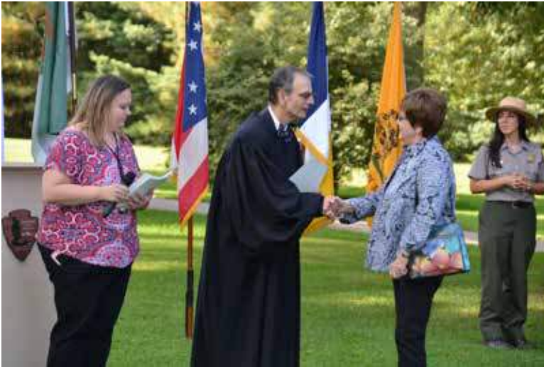
The Honorable Judge William Baughman of the U.S. District Court of the Northern District of Ohio presents the Certificates of Naturalization to the new citizens.