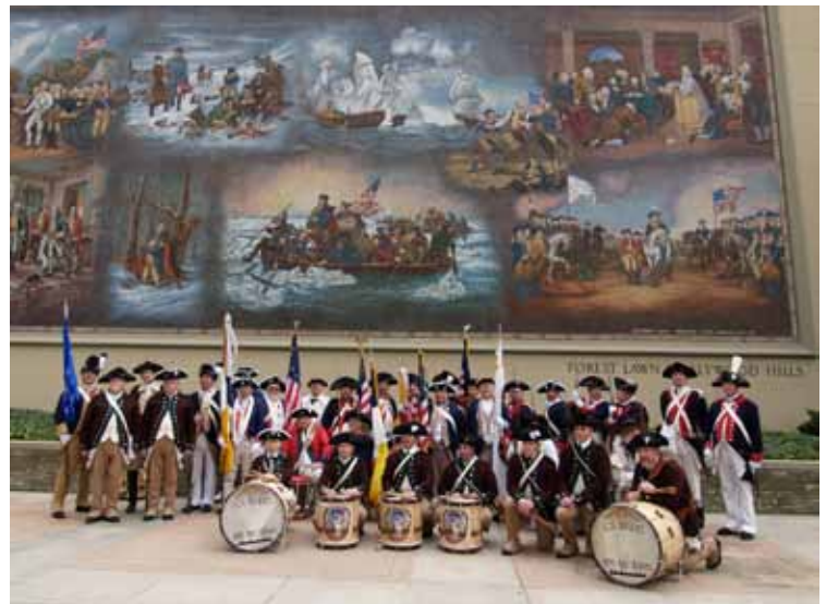
California Society, SAR Color Guard and the Los Angeles Fifes and Drums

Sons of Liberty Chapter - SOL is the host chapter of the Massing of the Colors General George Patton Chapter, Harbor Chapter, Kern Chapter, Orange County Chapter, Redlands Chapter, Riverside Chapter, Silicon Valley Chapter