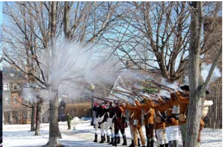
Ceremonies on the Hill - Henry Knox color guard and the Lexington minute men doing a musket firing