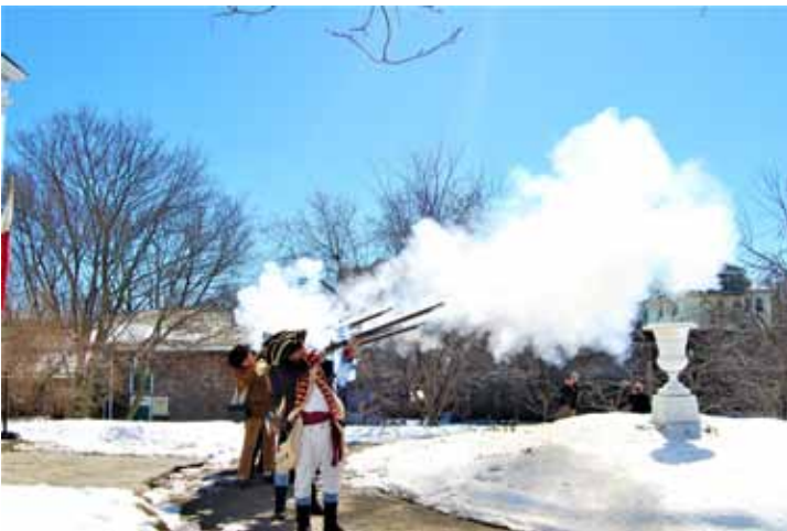
Henry Knox color guard and Lexington minute men firing.