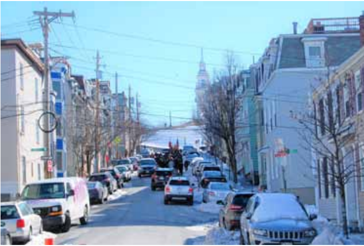
Evacuation day Same group going up the hill to Dorchester heights