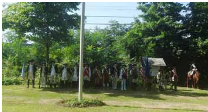
Aug 2016 Shade on a Hot August Day