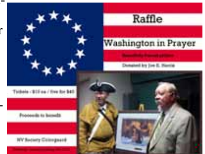
Promotional artwork used for fundraising raffle.