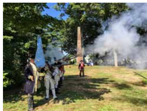
Aug 2016 Volley Fire