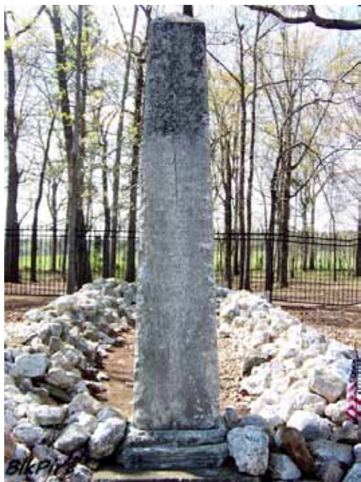
Battle of Waxhaws / Buford's massacre May 29, 1780