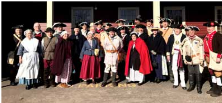
Group photo of the Connecticut Line