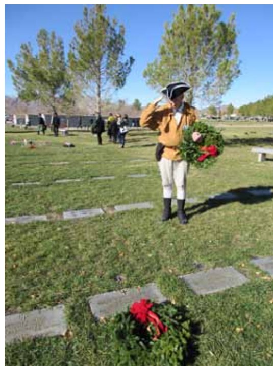
Left - Completed section of the SNVMC with wreaths at every grave site