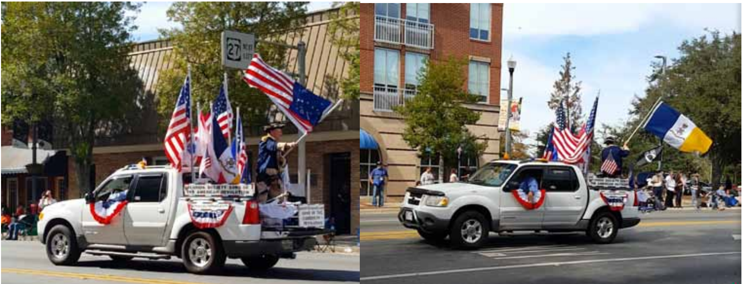
Tallahassee Veterans Day Parade