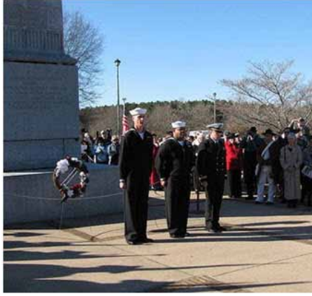
Officers & Crew of the USS Cowpens travelled from San Diego, CA to lay a wreath at the U.S. Monument during the annual commemorative ceremony.