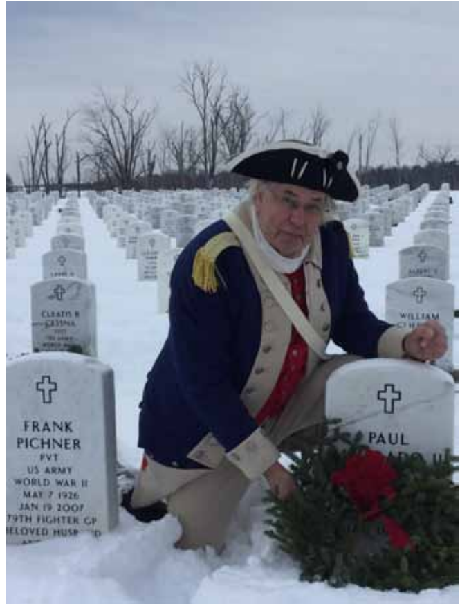
Holly Cemetery, Holly Mi. December 17th at the Wreaths Across America Dedication, one of three Cemeteries the MISSAR Color Guard attended this day to honor our Veterans. MISSAR Color Guard Commander kneeling and placing a wreath at the grave of a Veteran.