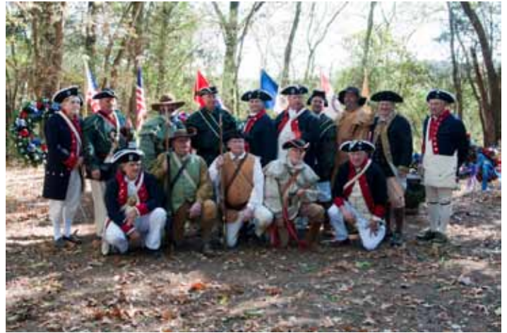
Above Meigs event Below Campbell Event