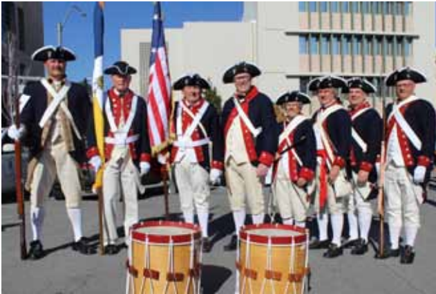
Northern Nevada Chapter Color Guard & Fifes & Drums