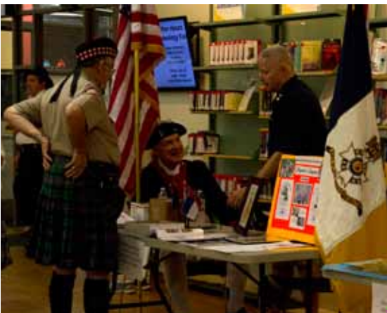
Signers Chapter's CCNGS Fair booth