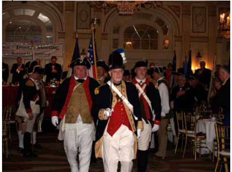
Color Guard retiring the Colors at the Saturday Banquet.