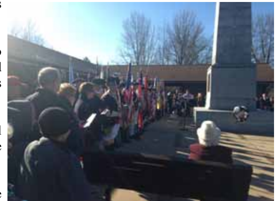
The NSSAR Color Guard at the National Monument

Prior to the placement of the NSSAR wreath by President General Brock, the NSSAR Color Guard formed an arch around the rear of the monument. After the wreath presentation, the Color Guard posed for pictures.