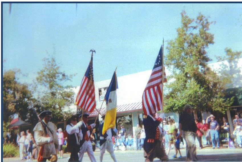
Veterans Day Parade November 11, 2014 Inverness, Florida